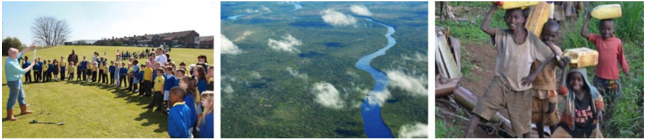
Sample Carbon Offsetting Projects - UK Schools Tree Planting - Amazon Avoided Deforestation, Brazil - Clean Water projects, Rwanda

The offsetting process is simple and straightforward - just visit www.carbonfootprint.com/carbonoffset.html and type in your CO 2 tonnage (from the front page of this report) and this will show you the latest range of projects and their pricings. Certification is available to download online.